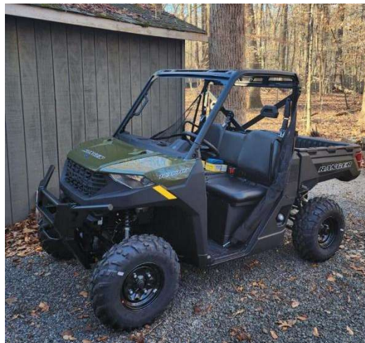
The Club's new UTV.