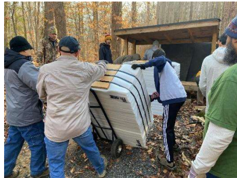
Installing a block at the 60-yard target.