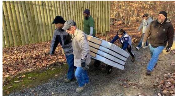
December Work Party

Thanks to all members who helped out at the December Work Party.