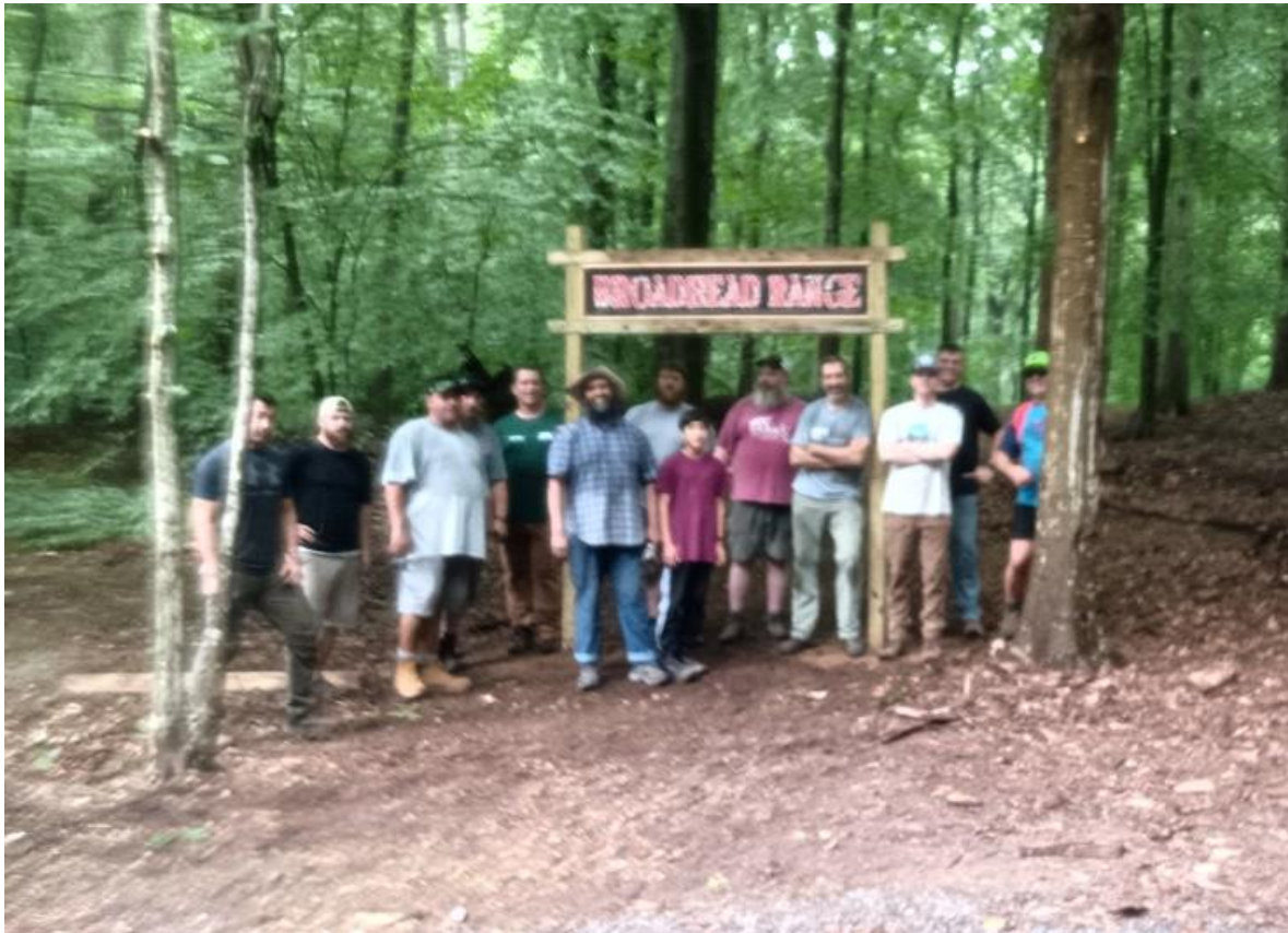
Most of the workers (unfortunately on the sweaty day, the focus didn't work so well)