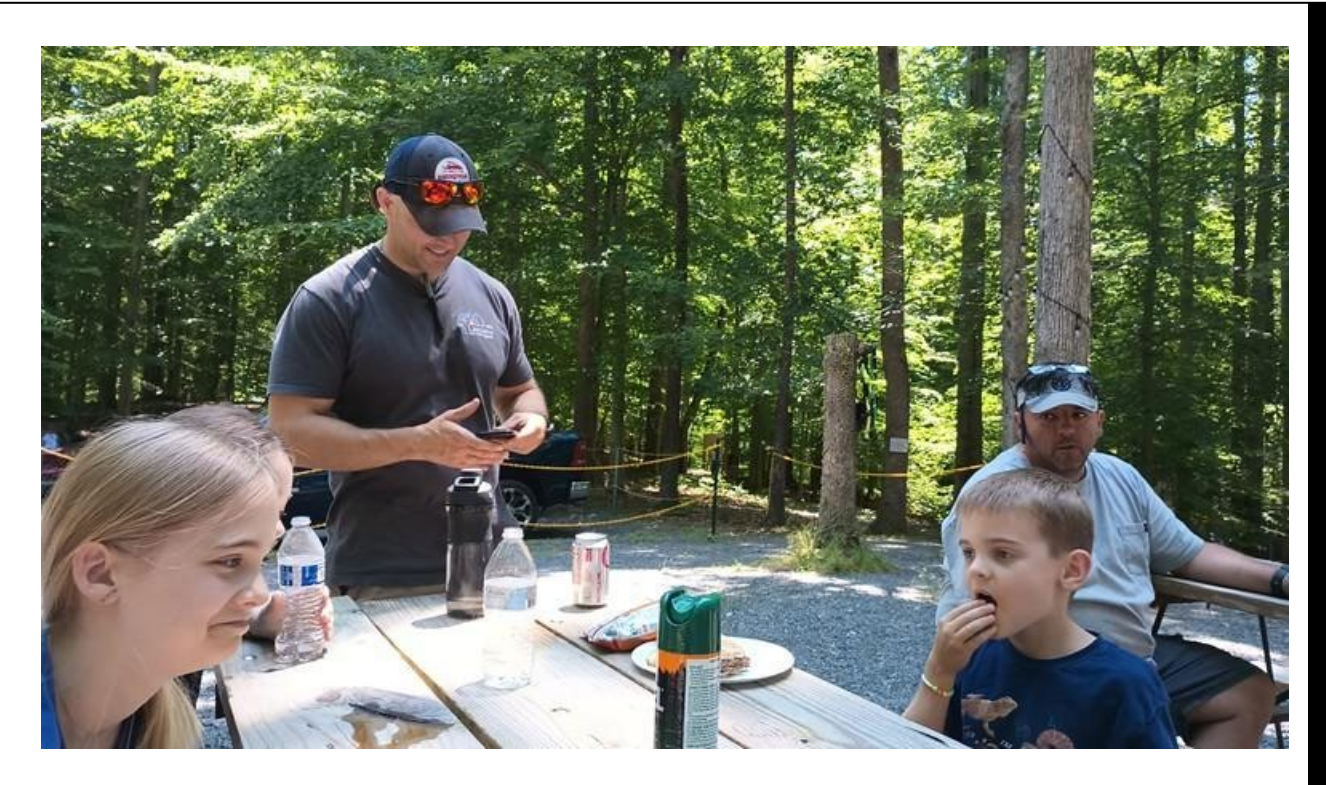
I think there's at least one adult in the picture....