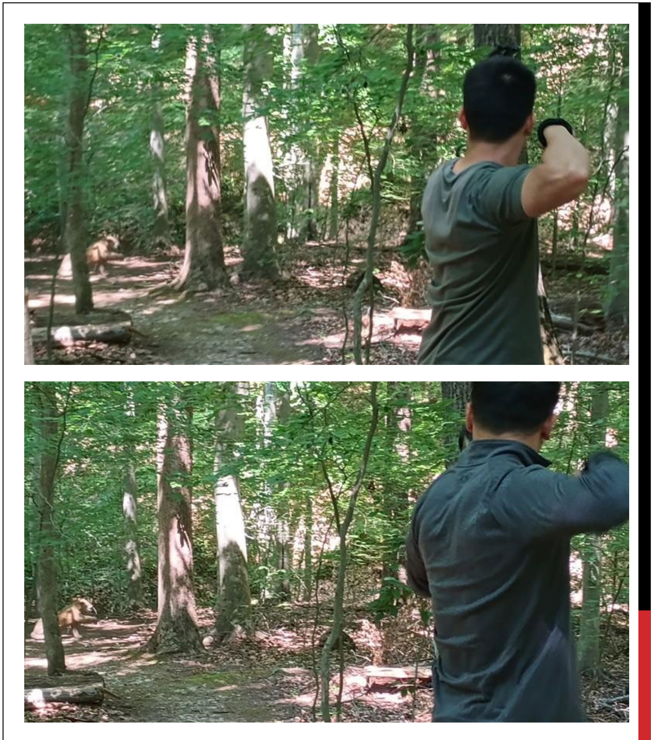
Can you spot the differences between the photos?