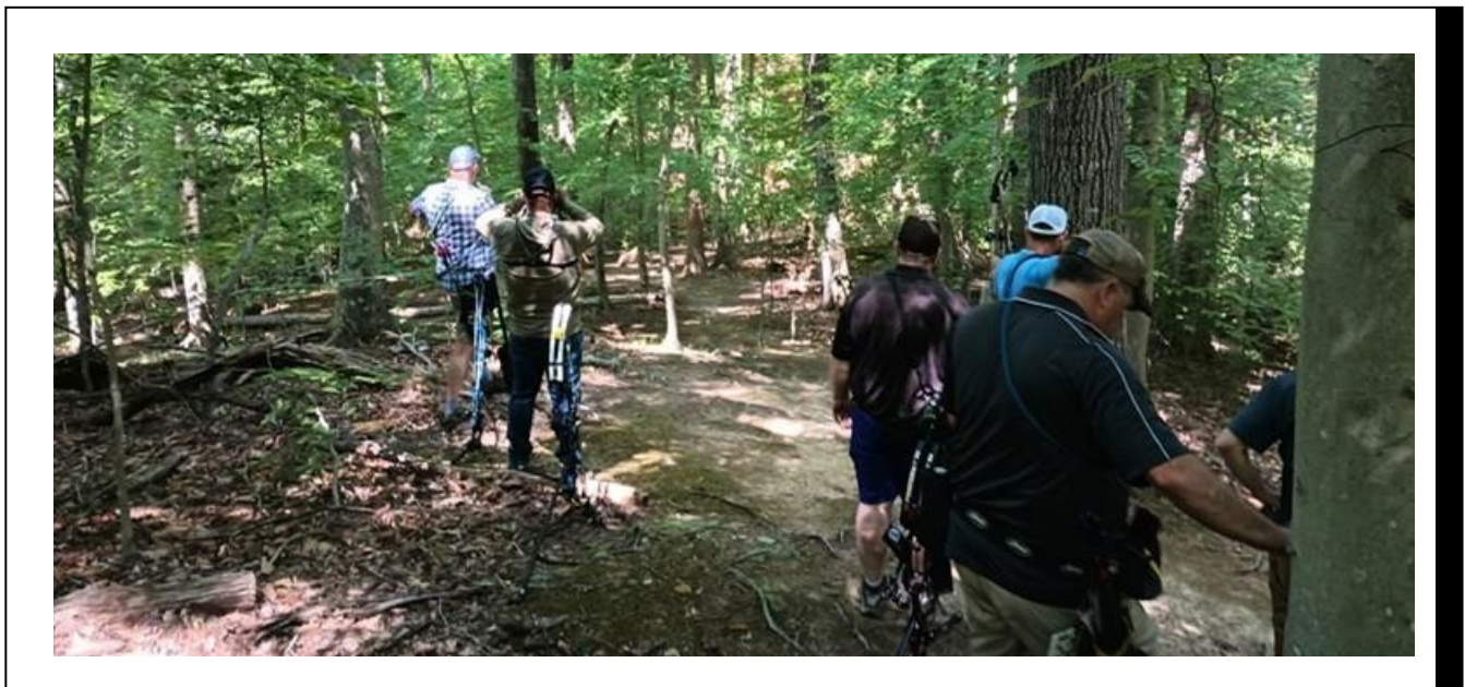
Whilst at time there were backlogs, it was a good time to witness others' techniques, and discuss our own approaches and generally be social.