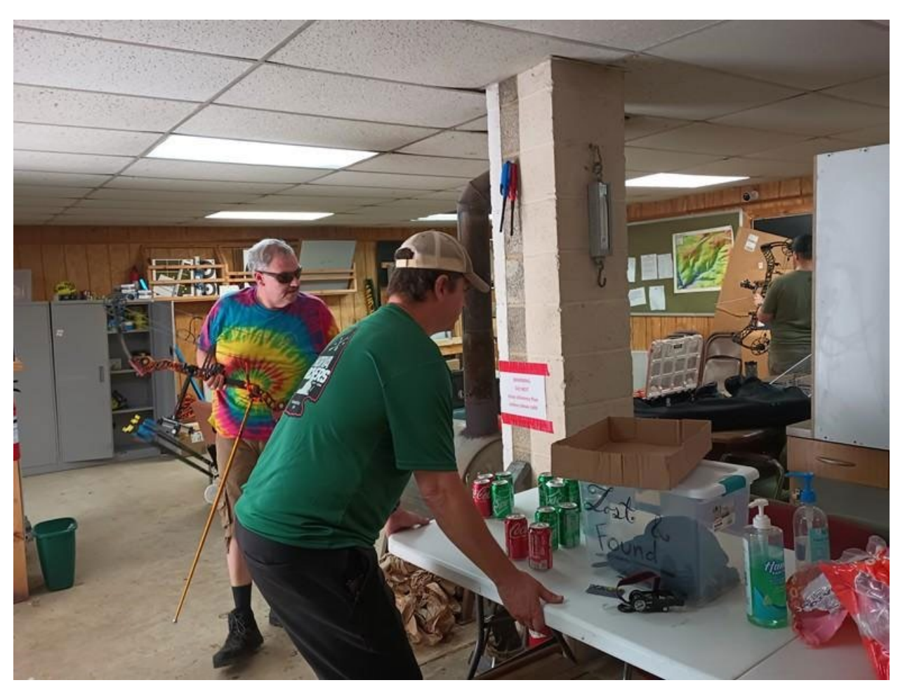
...whilst the clubhouse was still in full swing around the remodeling once it was cleared.

If you want to add some photos, tidbits, or other news (or are just sick of my photos and want to replace them with something different), don't forget to send it into the Secretary @norva.club (minus the space) for the next Newsletter.