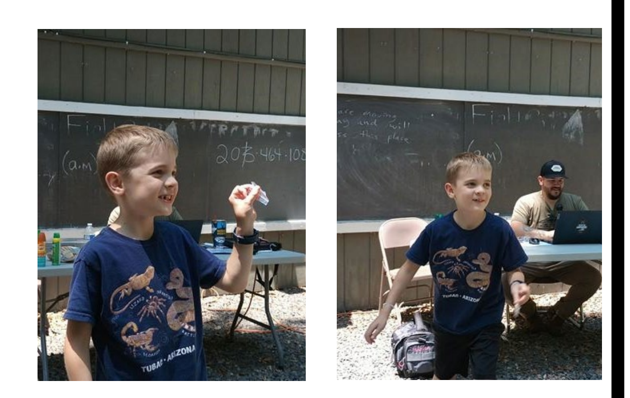
A very happy First Bow Hunter