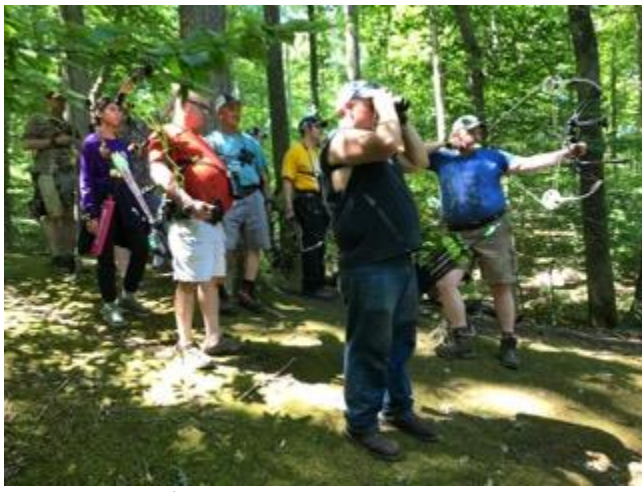
Sunday Morning Mentor Group at NORVA

As mentioned in the announcements section, elections will be held during the September 7 club meeting. We very much would like a large turnout. If there are no further nominations by the upcoming meeting, then the position(s) will forgo a vote and automatically be appointed.